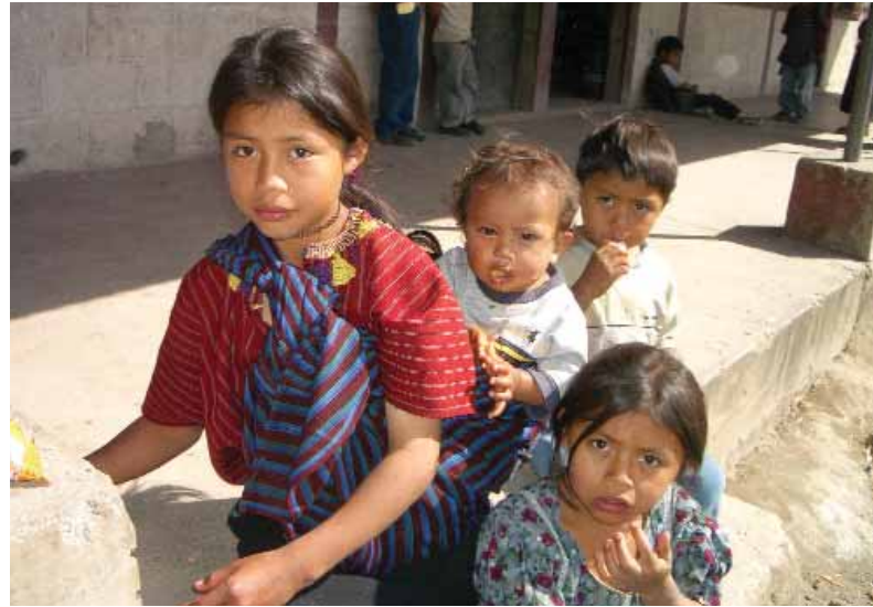
In Patzún and Santa Apolonia, 67% of children under age five are chronically malnourished.

Not all has been easy this summer. As many of you know, we recently suffered an office break-in here in Guatemala, losing all of our electronic equipment. This experience made us appreciate the extraordinary support network we have with our board of directors, donors and friends. In a very short time, they helped us to recover from this brief setback.