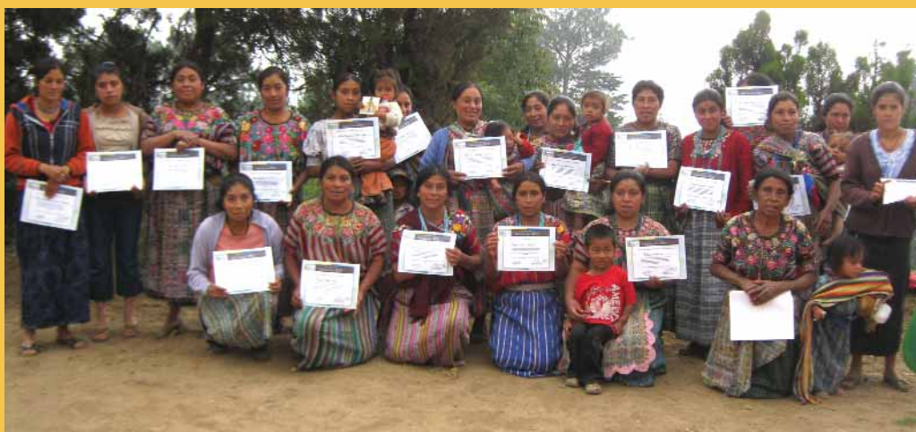
Women from two Strong Family Centers “graduated” as they are now able to work on their own to address chronic malnutrition in their villages.